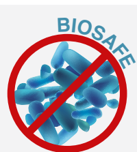
Hygiene and infection control