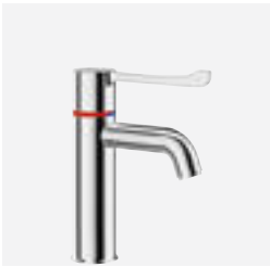
Available in a non removable version