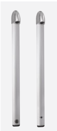
Creates a design DUO with the SPORTING 2 time flow or electronic shower panels