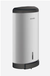
Soap dispenser specifically designed for showers